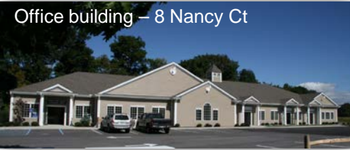
Office building – 8 Nancy Ct